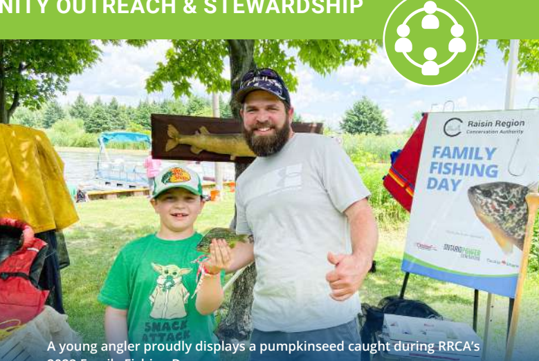
2022 Family Fishing Day.